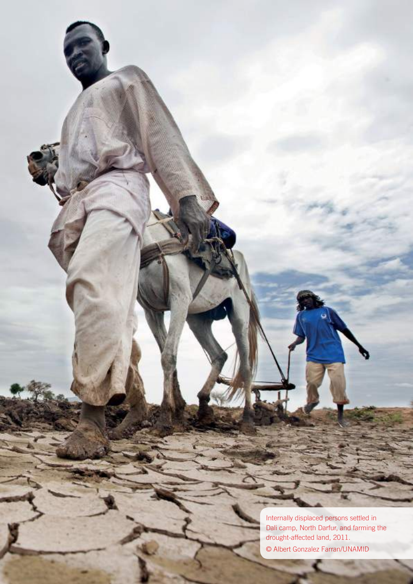
Internally displaced persons settled in Dali camp, North Darfur, and farming the drought-affected land, 2011.