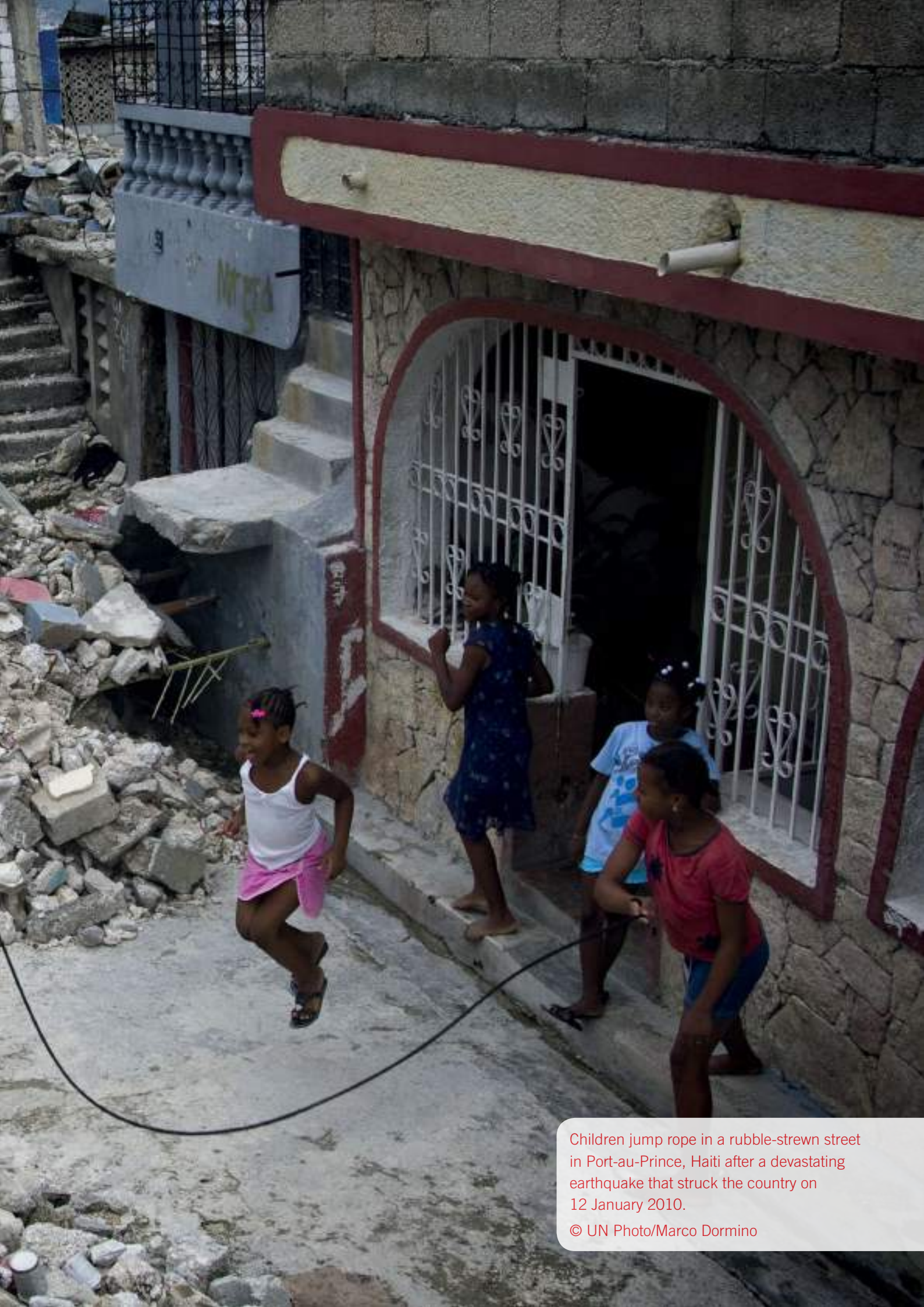
Children jump rope in a rubble-strewn street in Port-au-Prince, Haiti after a devastating earthquake that struck the country on 12 January 2010.