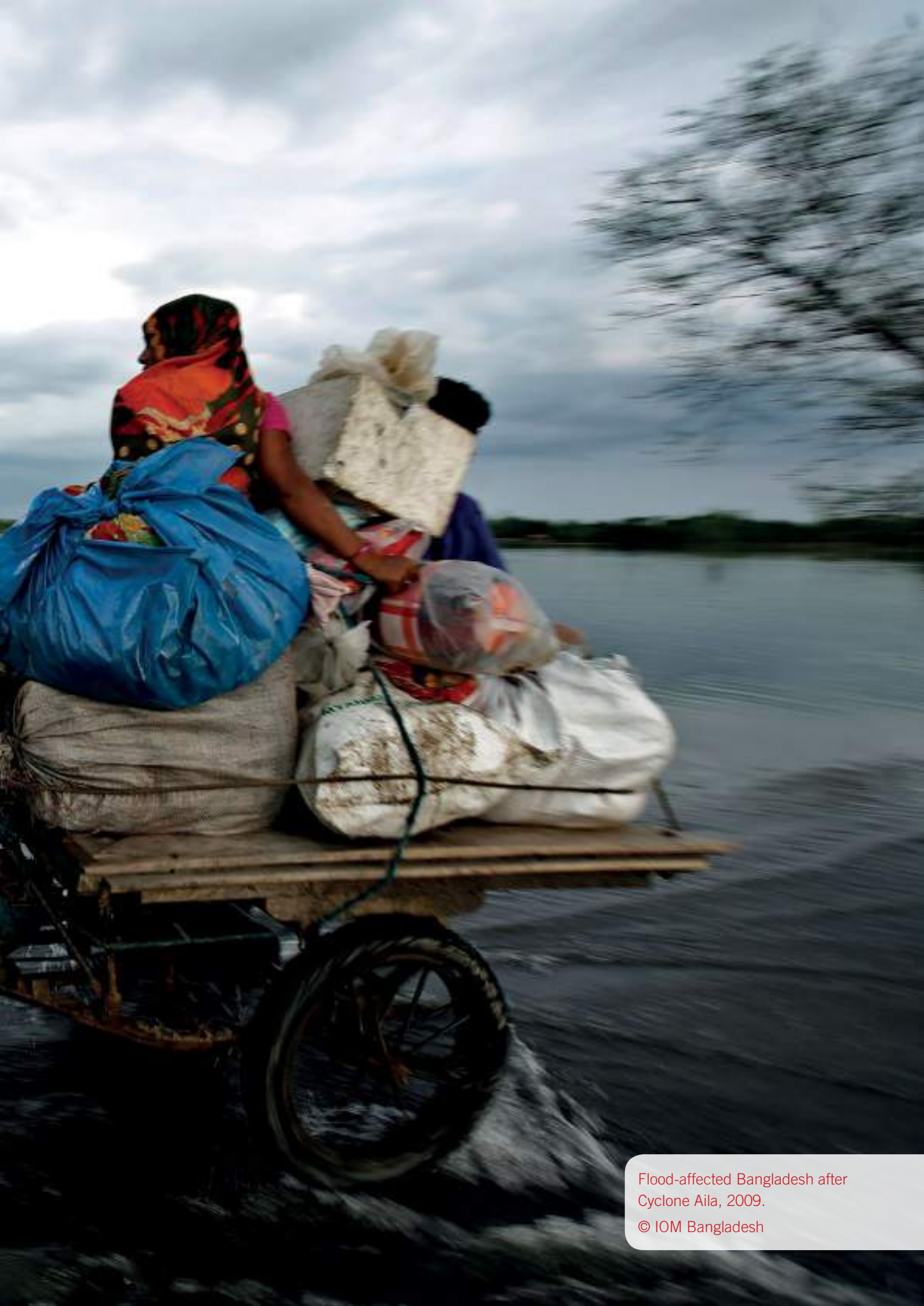
Flood-affected Bangladesh after Cyclone Aila, 2009.